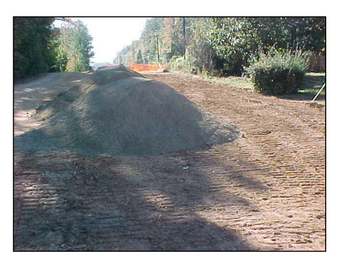
Figure TSG-1 Topsoil to be Spread.