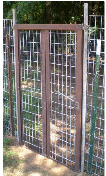
Saloon Door Trap.