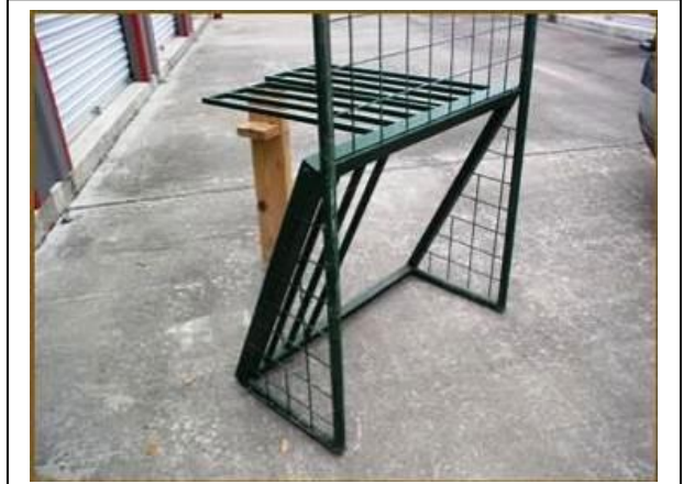
Root Gate Trap Door. Made into 3 segments that are one way only.