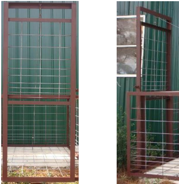
Trap Door - Guillotine or Drop Door.

NOTE: THIS DOOR WOULD NEED TO BE BUILT WITH HORSE PANELS OR SIMILAR TO MEET ALABAMA SPECIFICATIONS. CATTLE PANELS ARE NOT ACCEPTABLE.