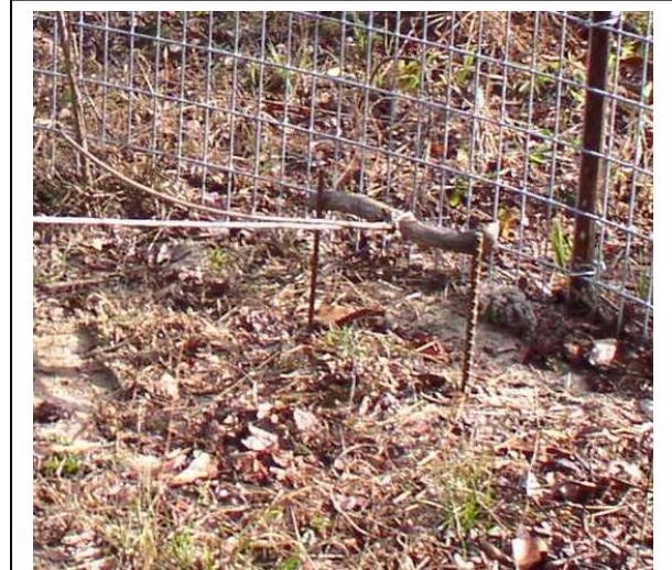
Root Door Trigger Mechanism.