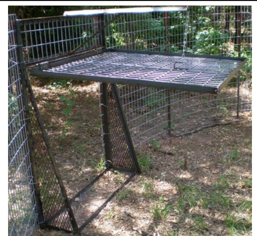
Root Gate Trap Door.