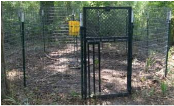
Root Door "Trainer". Door is made into 3 sections, each door swings independently of the others. Door sections swing both ways during pre-baiting phase. A metal stop is installed when setting trap so door will only swing to inside.