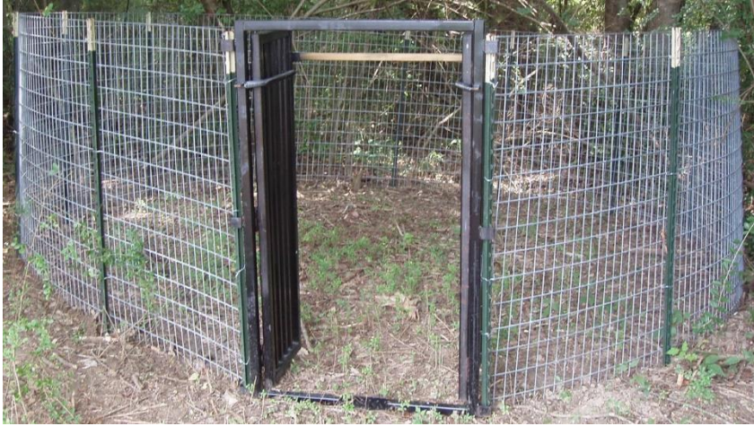
Saloon Door Trap