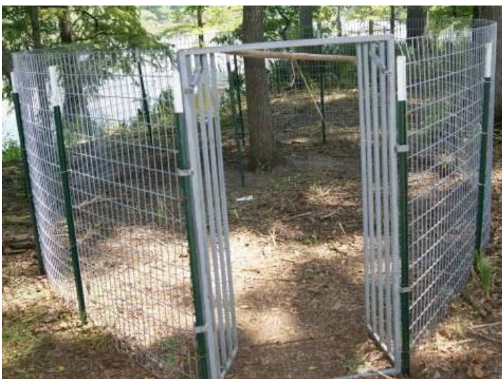
Saloon Door Trap.