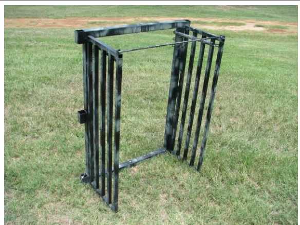
Saloon Door Trap.