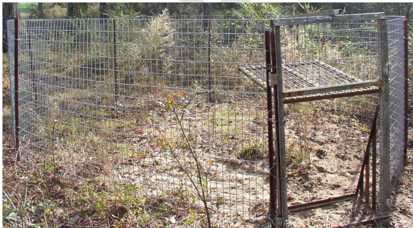
Root Door Trap.