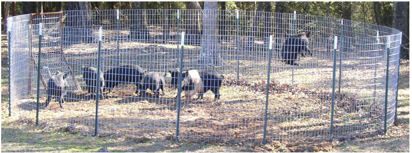
Root Door Trap with pig in mid-air jump trying to escape.

NOTE: Refer to the Trap Construction section and Check List contained within this Job Sheet to ensure your trap will meet specifications.