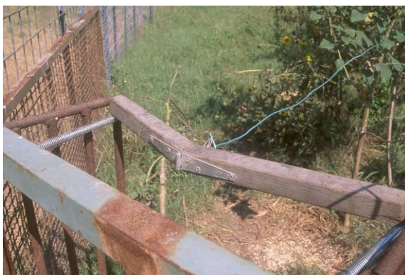
Saloon Door - Trigger Mechanism.