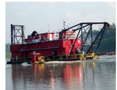
Dredge removing sediment from the Alabama River.